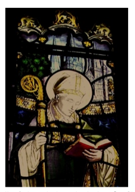
Detail of the window depicting St Chad.